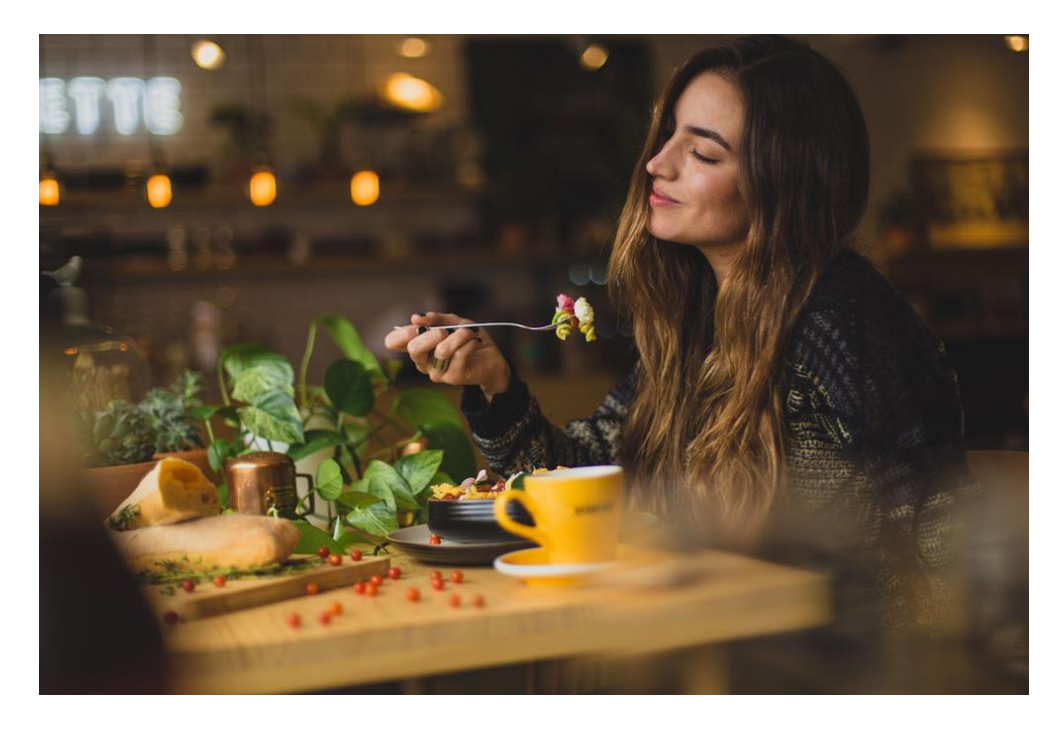
When thinking about the future healthy options become more attractive.

The association between "healthy nutrition" and "feeling good in the future" was particularly clear in four countries: Australia, South Africa, the USA and United Kingdom (approx. 23%). High-protein foods stood out among the Chinese participants. Water was particularly important for Germans, and for Italians, "natural" foods stood out.